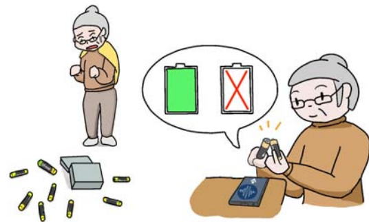
Fig.1 Tapping method