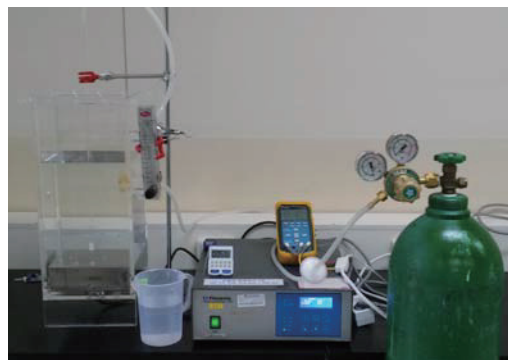
Fig. 1. An experimental setup.

To quantify sonochemical oxidation, KI dosimetry was used. The concentration of KI was 1 g/L and the solution volume was approximately 12 L. The liquid height from the transducer module to the water surface was 25 cm (equivalent to 6\lambda , where \lambda is a wavelength of applied ultrasound). The concentration of triiodide ion was analyzed using a UV-vis spectrophotometer at 350 nm. The result of each condition was compared using the cavitation yield, which means the amount of sonochemical reaction product, as follows: